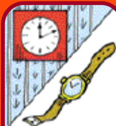
horológium pariétinum / horológium armilläre