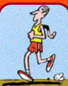
grandi gradu ambuläre