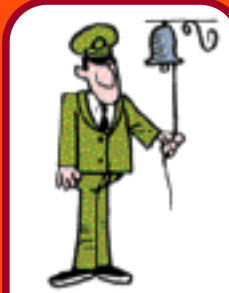
íanitor, oris m.